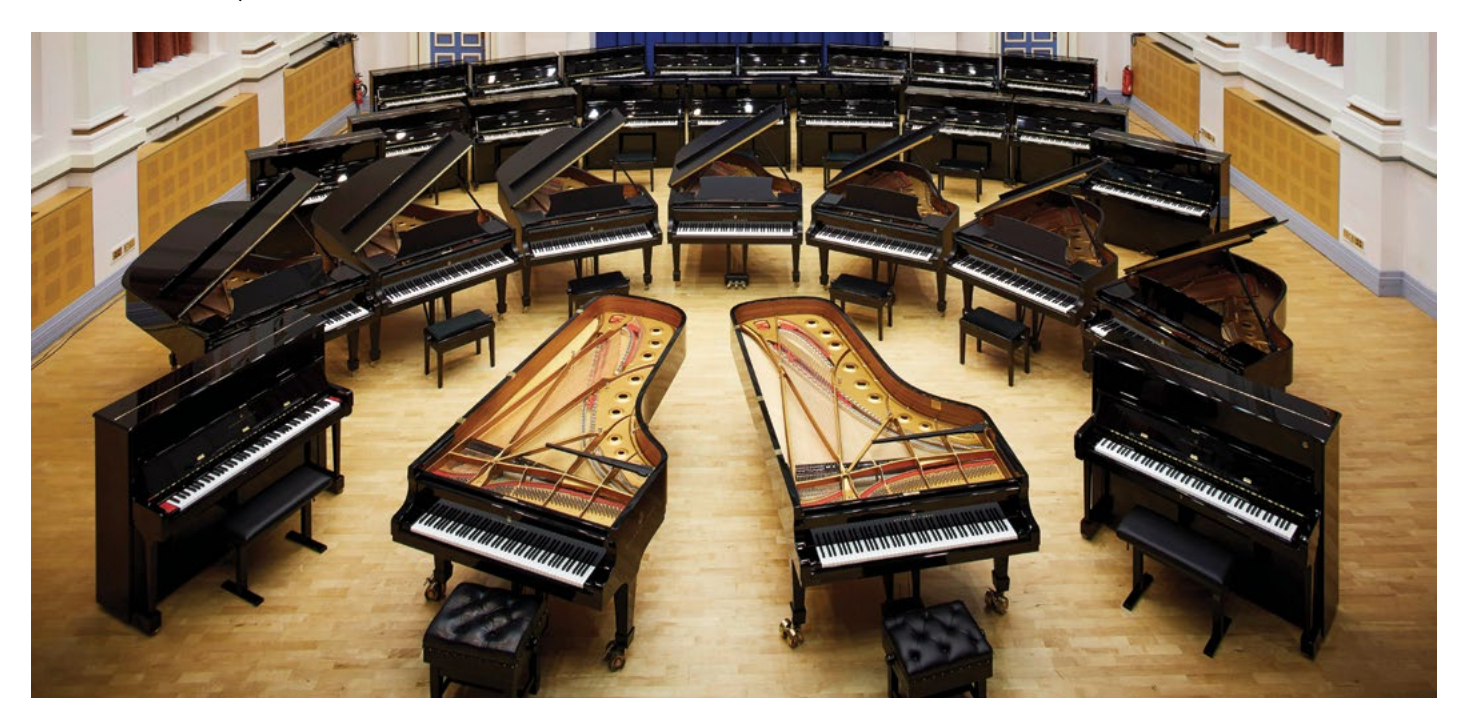
Clothworker's Centenary Concert Hall.

majority of the pianos are new Steinways. It is highly befitting that the University of Leeds is now one of the elite few, not only enabling musicians to reach their full potential, but also enriching the experience of every student with a passion for music."