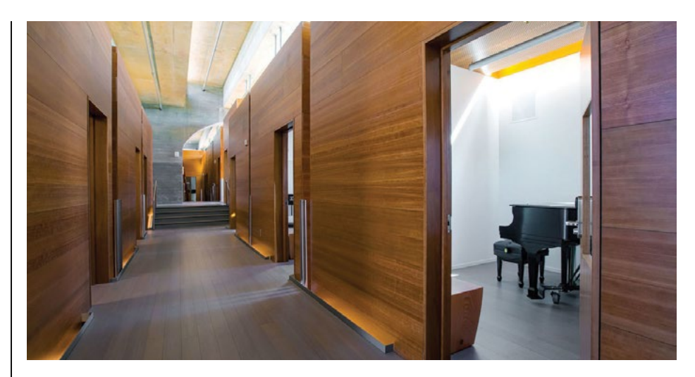
Pianists can almost reach out and touch the clouds from Princeton University's new Music Building, ingeniously designed by Steven Holl Architects of New York with one dozen acoustically-isolated practice rooms.