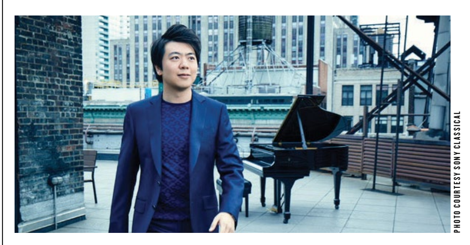
Lang Lang.