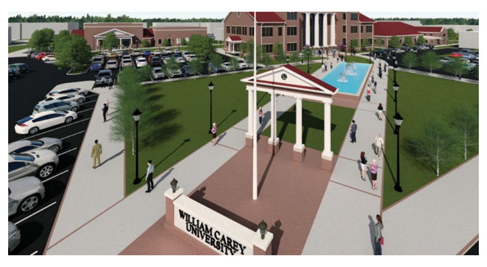
Architect's rendering of new entranceway planned at WCU.