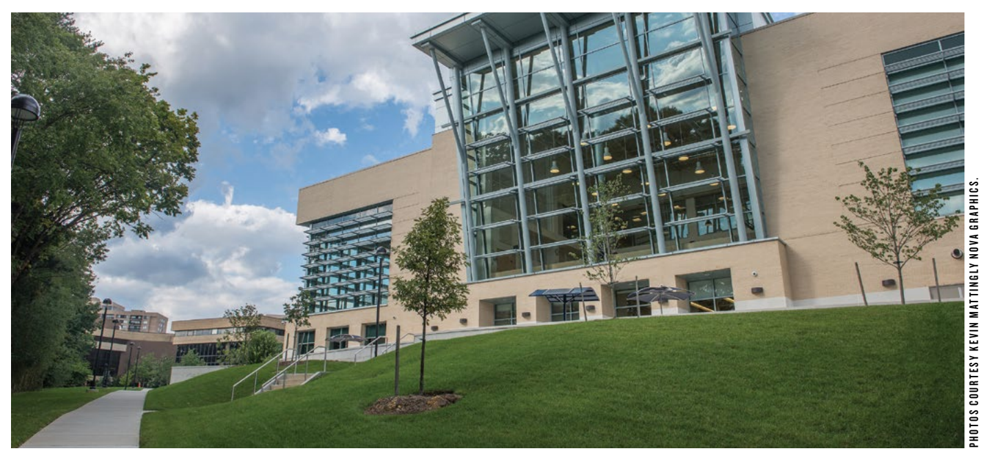
The Center for Design, Media and the Arts.

Established in 1964 as the Northern Virginia Technical College, NOVA today has nearly 80,000 students and more than 2,500 faculty and staff members at six campuses and four learning centers, according to its website. It is also one of the most internationally diverse colleges in the United States, with a student body consisting of individuals from more than 180 countries.