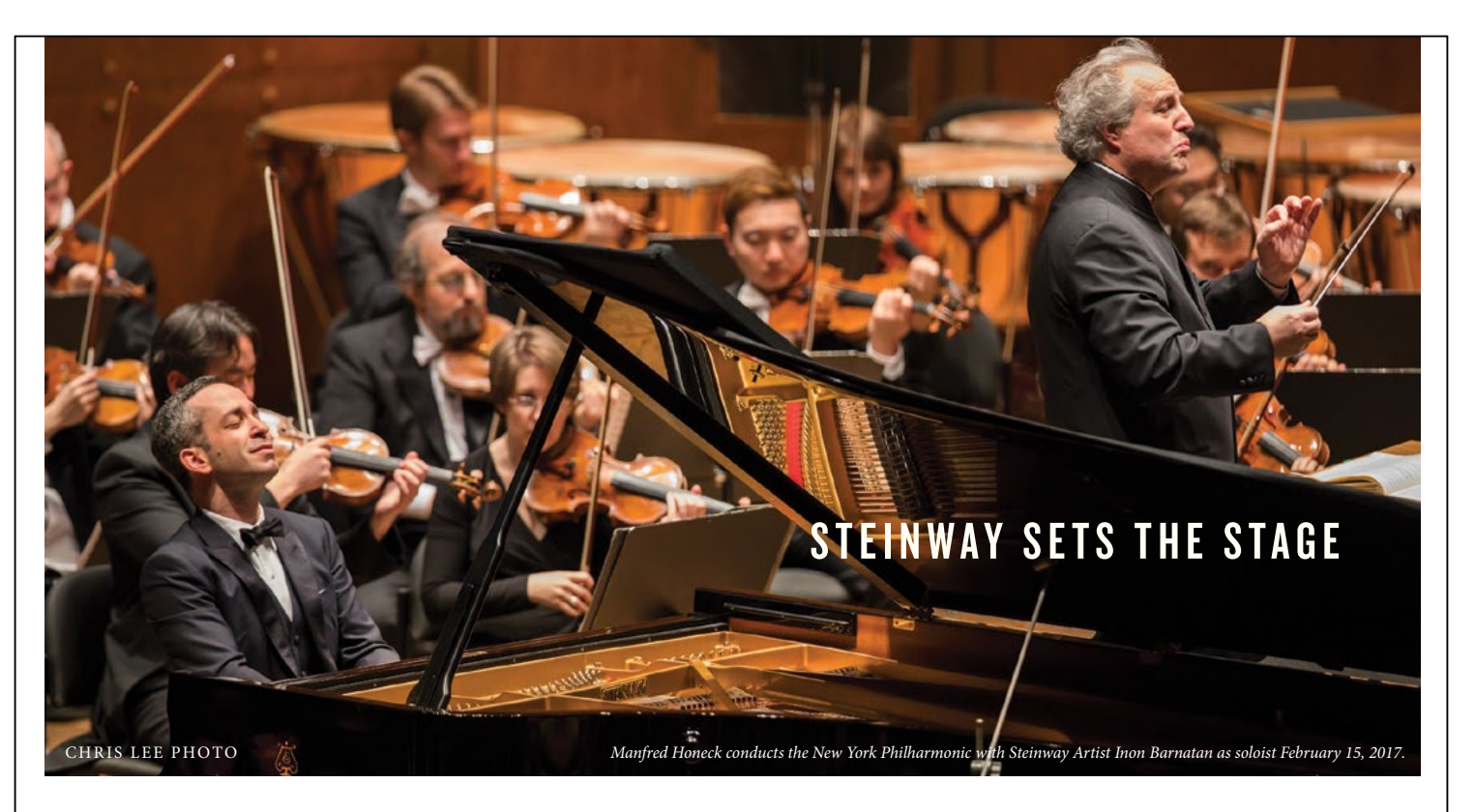
During the 2016-17 season, over 95% of concertizing pianists, when performing with orchestra, chose STEINWAY.